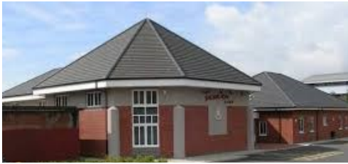
Salvation Army Centre Harrington Street Preston PR1 7BN