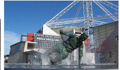
Headway Central Lancashire Sir Tom Finney Way PR1 6PA