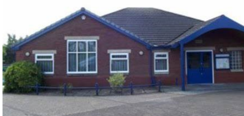
Cottam Community Centre Haydock's Lane, Cottam, Preston, PR4 0NY