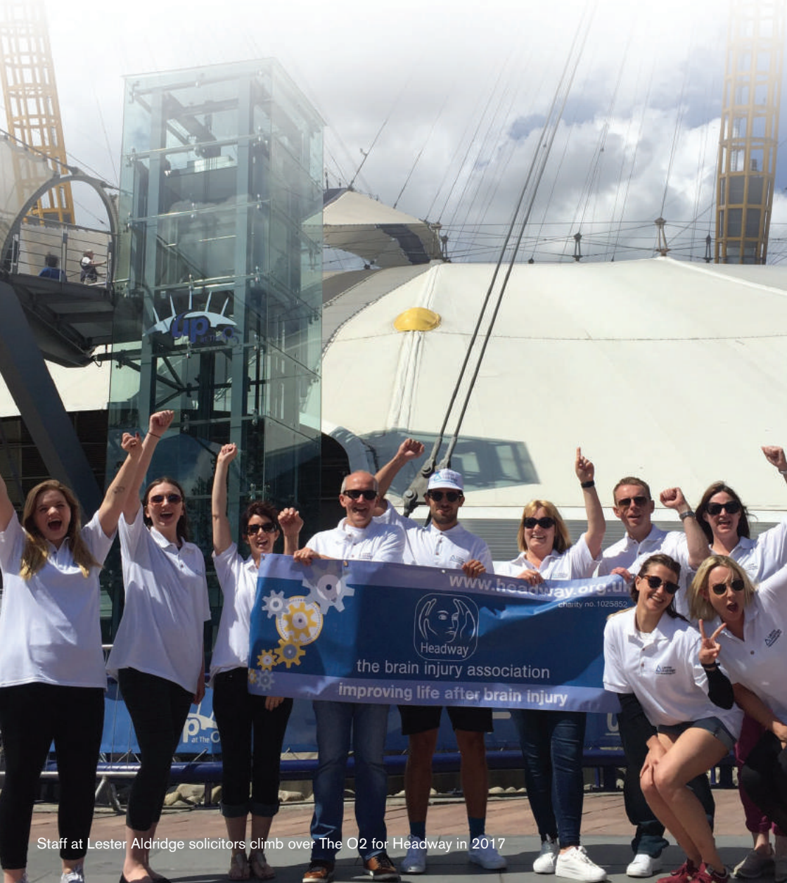
Staff at Lester Aldridge solicitors climb over The O2 for Headway in 2017